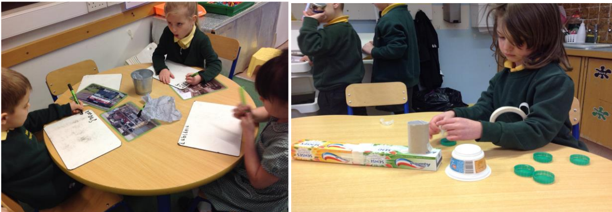
Class 1 working on their learning all about transport

Our Spring Term Curriculum Maps can also now be found on our school website and will allow you to view the learning objectives and activities taking place in your child's classroom. A curriculum map for each class can be found by going to 'Learning' and then into your child's class. If you have any expertise in any of the areas being covered this term, please do not hesitate to contact your child's teacher as we are always looking for extra ways to bring learning alive for our children.