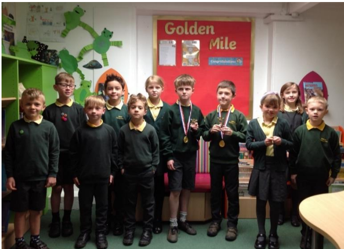
Bolham Cross Country Team

Finally I would like to end by saying a huge 'thank you' to all of the pupils and staff for all their continued hard work and support this term. I hope you all have a wonderful Easter and I look forward to welcoming you back to school on Monday 25 th April.